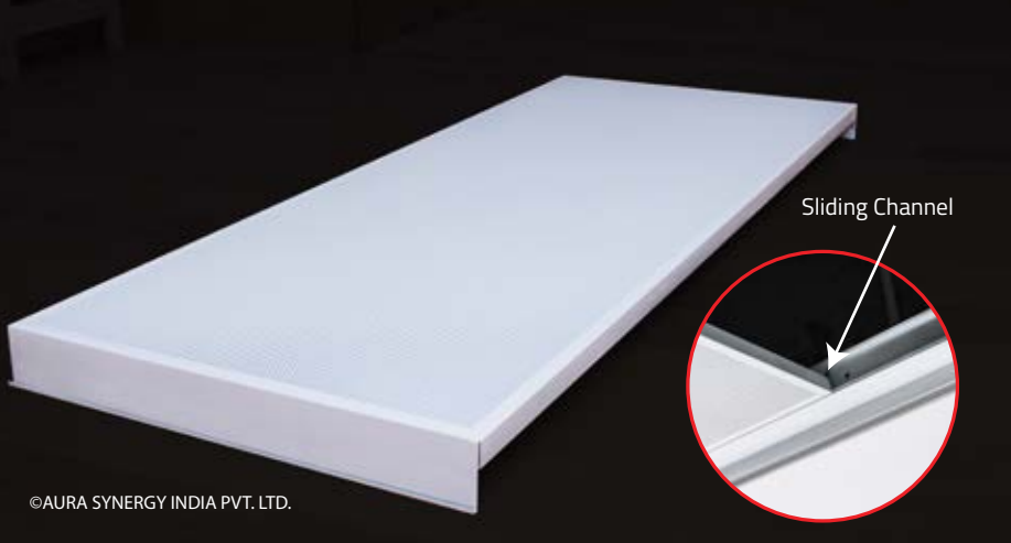
Ceiling panel type

GridSquare® Linear Hingeable Metal Ceilings provides great flexibility by offering a versatile free span feature. It makes it easy to dismount and gives easy access. This ceiling system also comes in variable modular widths and is compatible with perforated or solid panels.